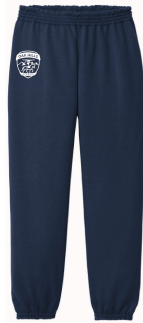
Youth Navy Sweatpant