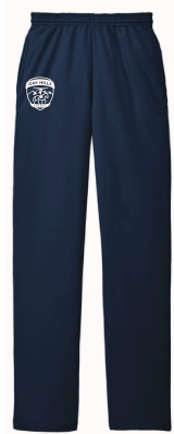
Adult Navy Sweatpant