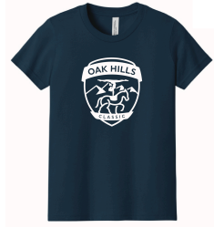
Youth Navy T-Shirt Sizes: XS - XL $18.00