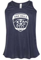
Youth Navy Tank Sizes: XS - XL $16.00