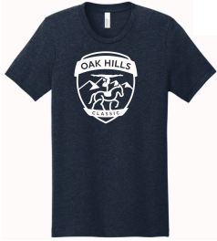
Adult Navy T-Shirt Sizes: S - 4XL $20.00