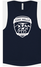
Adult Navy Tank Sizes: S - 5XL $18.00